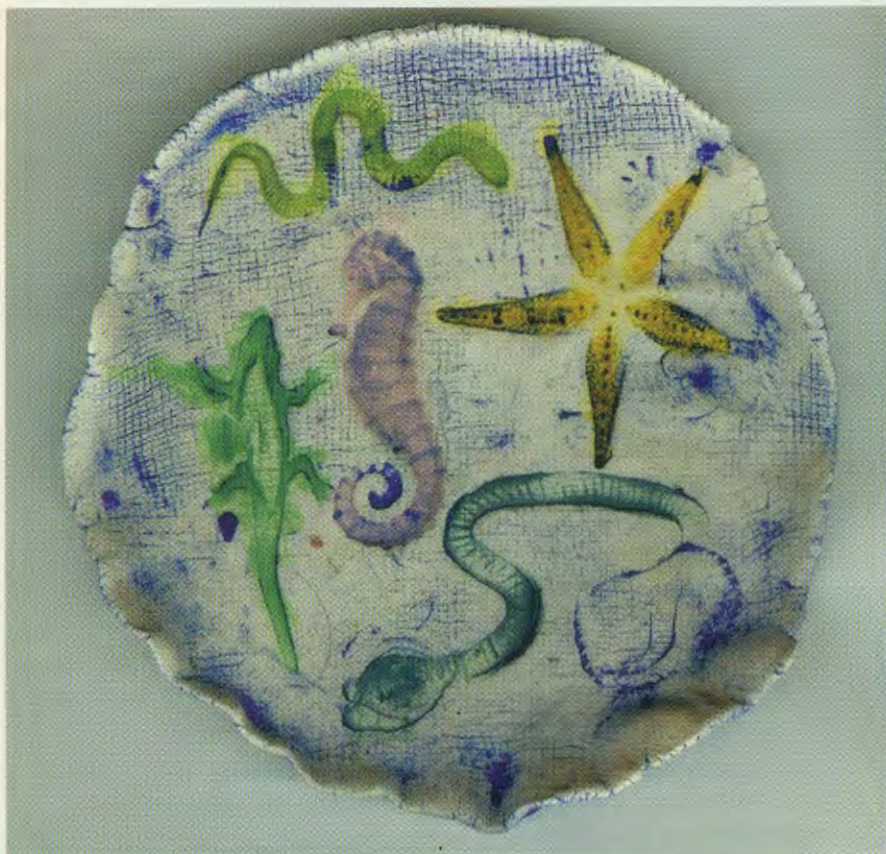
Figure 1. Fossil Project Result

originated. Figure 1 shows an art product from that lesson on fossils.